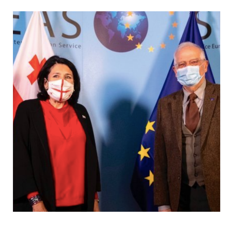
Read the full article on our website

On the 30th of December, China and the European Union concluded negotiations on the Comprehensive Agreement on Investment (CAI). While celebrated as an important step to create a more level playing field for European investors in China, it is highly critiqued by European lawmakers, the international media, human rights groups and the current US administration