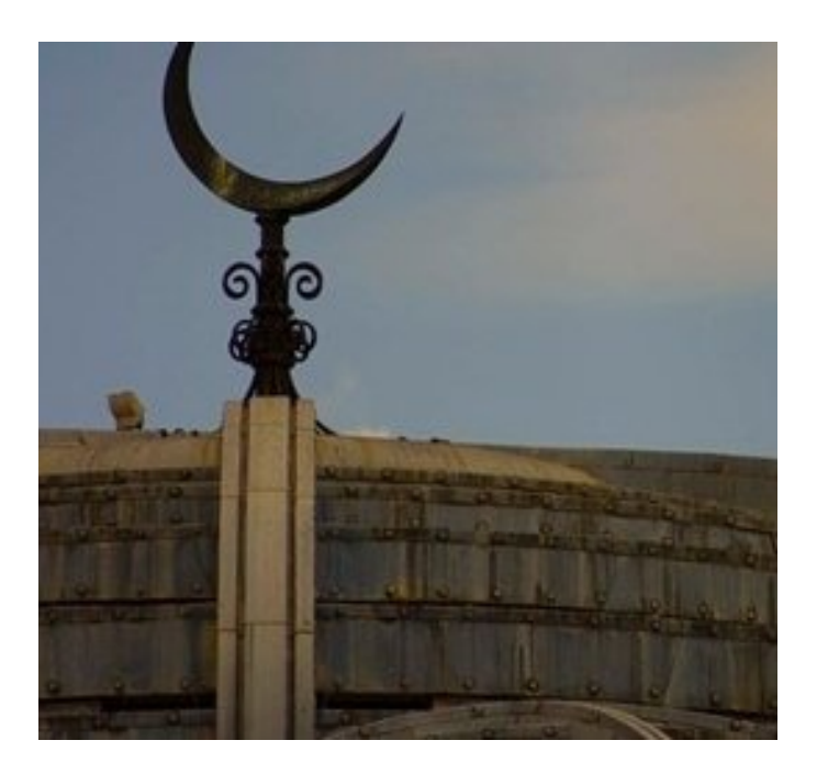
Read the full article on our website