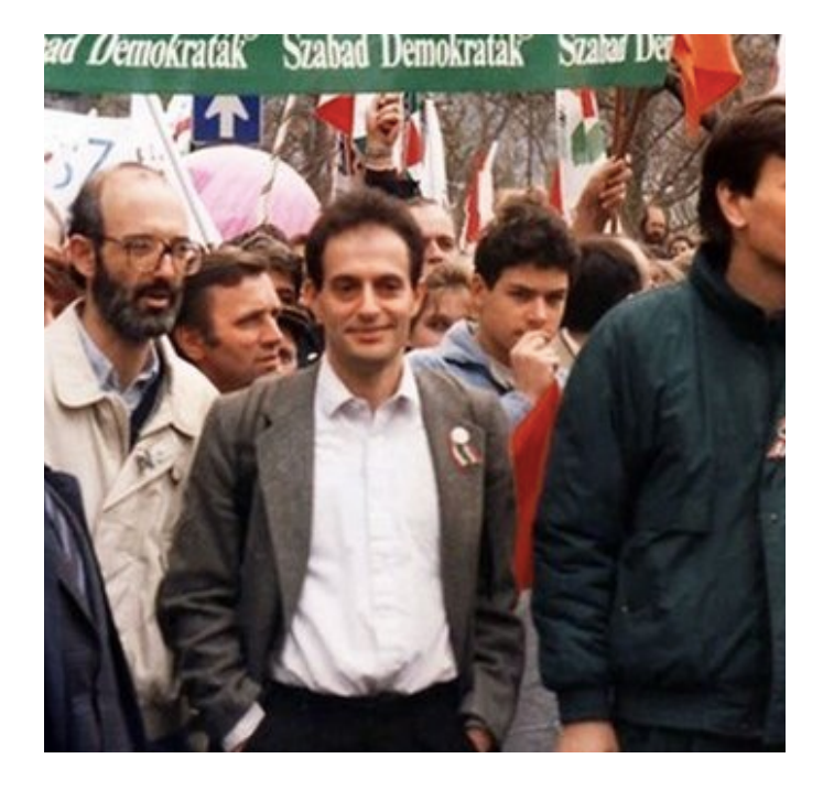
DEMOCRACY AT THE SYSTEM CHANGE: A DREAM COME TRUE?